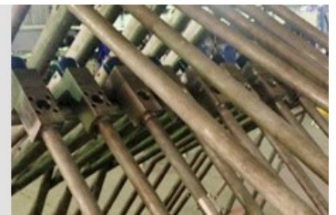
American PARKER high pressure hose, American SPRAY nozzles, Japan NSK bearings, 304 stainless steel rotate arm