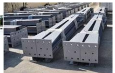
American Deublin rotate joint, Taiwan AIRTEC air components, 304 stainless steel housing, Hot dip galvanized frames