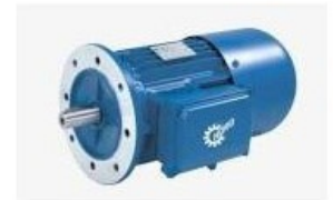
German Siemens Motor, Taiwan WULI WH-10120 pump, Italy SITI reducer, German NORD IP65 waterproof motor