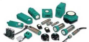
Taiwan DELTA PLC, French SCHNEIDER inverter, French SCHNEIDER electricals, German PEPPERL+FUCHS sensors