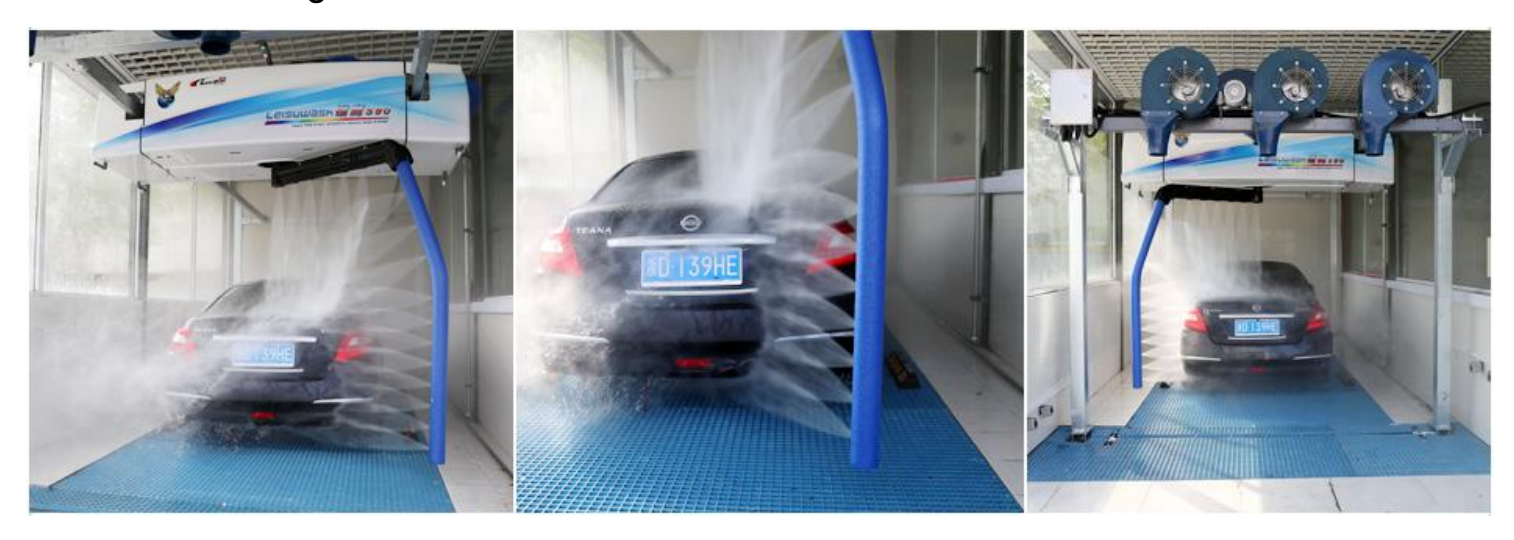
Magic Shampoo, Cleaning and Glazing Completed Simultaneously

The unique up and down eccentric design, light and smooth running control, using the speed equalization, pressure equalization and 360-degree rotary flushing of distance equalization are adopted to clean the car body at the maximum angle, comprehensively clean the cleaning blind zone, and clean the whole car in 50 seconds.