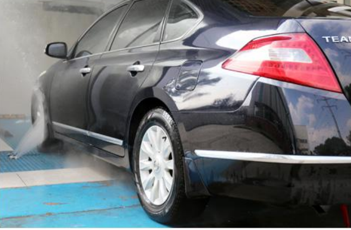
Car Wash Liquid Automatic Proportioning System